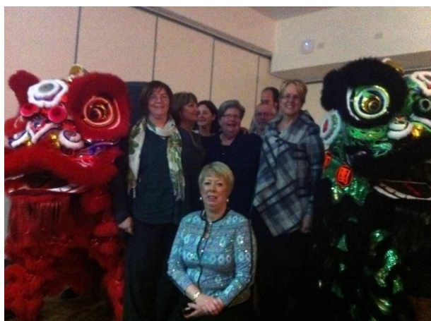
ACFE Staff getting up close and personal with the Bendigo Lion Dancers, who entertained us with a stunning performance over dinner