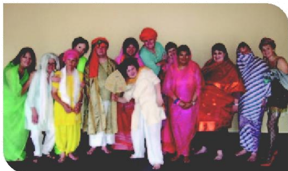
The "Curtains for Certain" ensemble backstage at the 2010 production.

Moe Life Skills' Theatre Studies (MLS) program for adults with an intellectual disability delivers employability and life skills through a 'non-classroom' structure. Theatre Studies targets key employability skills and delivers results for learners in content skills learning, improved confidence, self esteem and self awareness.