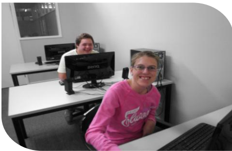
Happy students in the computer lab at Encompass.

ACFE would like to welcome Encompass Community Services Inc. as a newly registered Learn Local organisation in the Barwon South Western Region. Encompass provide opportunities to people with disabilities, people who may be disadvantaged and the general community, via specialist employment services, offering a range of accredited and non-accredited courses, life skills programs and small business ventures.