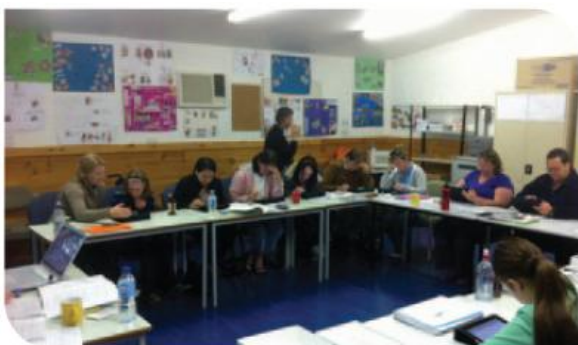
Students of UYCH's Aged Care course get hands on with the new technologies leading the way in their chosen industry.

Upper Yarra Community House (UYCH) found that many local aged care staff were overwhelmed with the need to use new technologies in their roles. In response, UYCH's team developed a unique delivery strategy using blogs, twitter and other collaborative platforms to teach aged care programs. Because many local aged care facilities use electronic devices to record information, UYCH provided new learners with iPads before they started the course. They set up an iPad helpline, however most students were able to get family members, especially children, to help them learn to use the iPad. This whole-of-family participation was a fantastic unintended outcome.