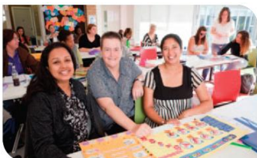
The look of satisfaction on these three learner's faces says it all! Wyndham Community and Education Centre is a deserving winner of the Outstanding Learn Local Organisation award.

Where one in six people in the community have English as a second language, a course like English for Hospitality is an essential link for people entering the workforce. This course combines practical work experience, cooking under instruction and serving meals in the teaching kitchen with the language skills needed to work in hospitality.