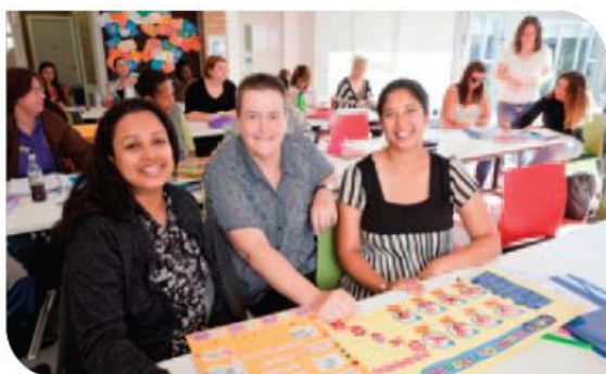
The look of satisfaction on these three learner's faces says it all! WCEC is a deserving winner of the Outstanding Learn Local Organisation award.

Where one in six people in the community have English as a second language, a course like English for Hospitality is an essential link for people entering the workforce. This course combines practical work experience, cooking under instruction and serving meals in the teaching kitchen with the language skills needed to work in hospitality.