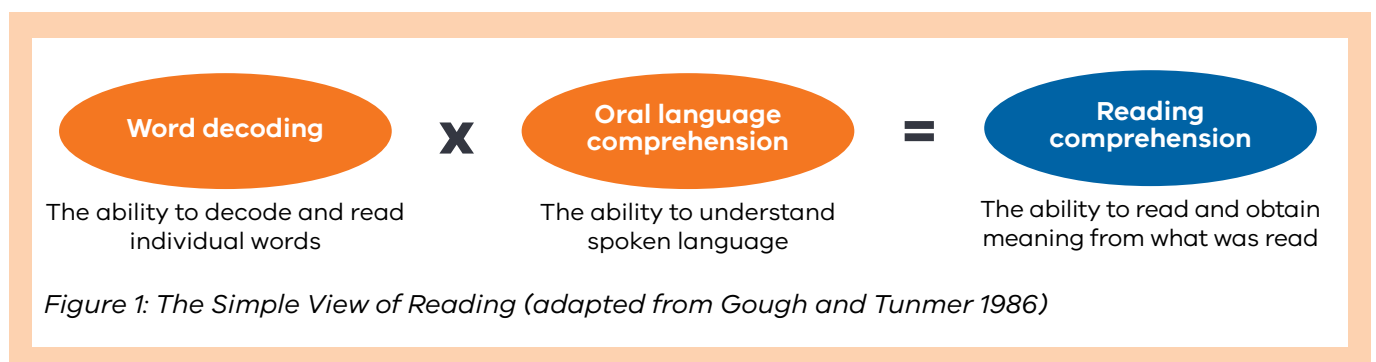
Figure 1: The Simple View of Reading (adapted from Gough and Tunmer 1986)

In English, there are 26 letters, 44 phonemes and more than 200 ways to represent phonemes in spelling. All children, including those with dyslexia, will benefit from being taught explicitly and systematically to decode words (Castles, Rastle & Nation 2018; Rose 2006; NICHD 2006).