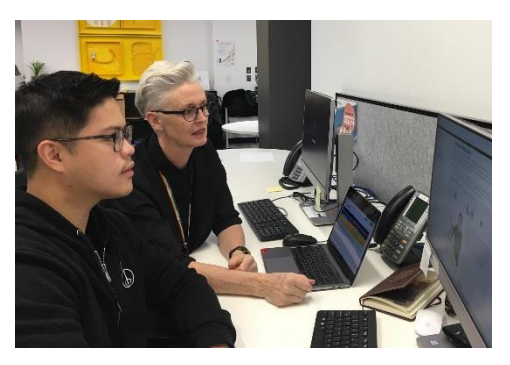
FSSI Project Team at work

High quality, accessible curriculum – shaped by Experts by Experience and informed by research – that prepares students to work in the new NDIS consumer directed care environment