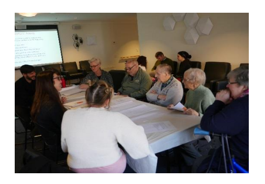
Co-design session at Waverly Gardens Aged Care Service, March 2018