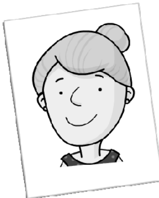
grandmother (father's mother)