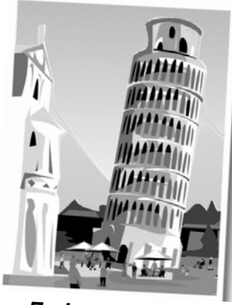
Ferien in Italien