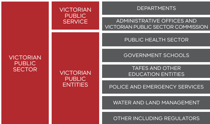
Figure 1: the composition of the Victorian public sector