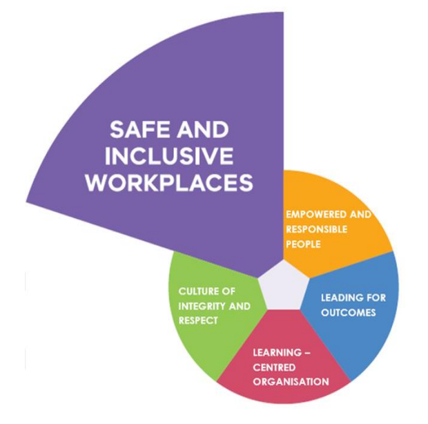
Figure 2- Investing in Our People (Objective 4 – Safe and Inclusive Workplaces)

better arm staff in coping with workplace MHW pressures and maintaining a positive work/life balance.