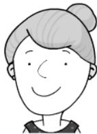
grandmother (father's mother)