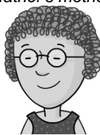
grandmother (father's mother)