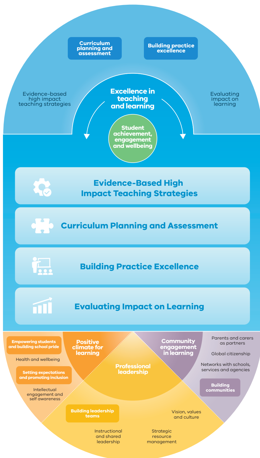
Framework for Improving Student Outcomes (FISO)

Each of the initiatives is based on evidence and has been designed to support you to deliver better teaching, stronger leadership, and increased support for every child and young person in Victoria.