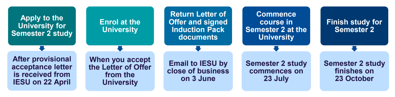
Table 4: Overview of key steps once accepted*

* Dates are indicative and subject to final notification in early 2022.