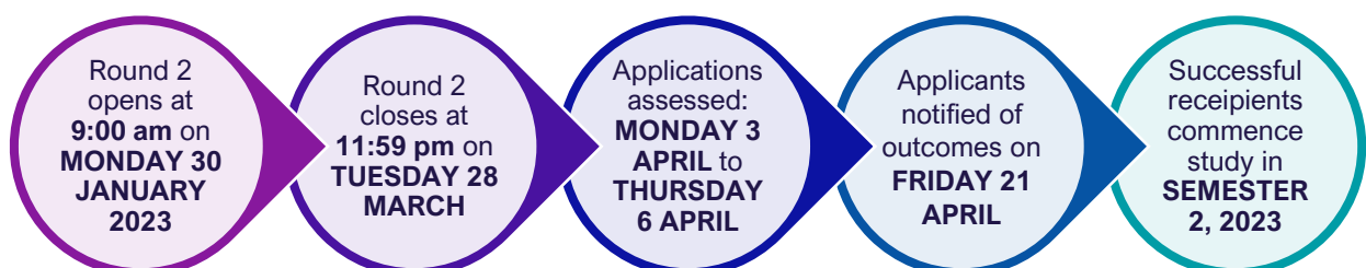
Figure 1: Key dates in Application Round 2

Figure 1 below is an overview of key dates in the application, assessment and selection phase.