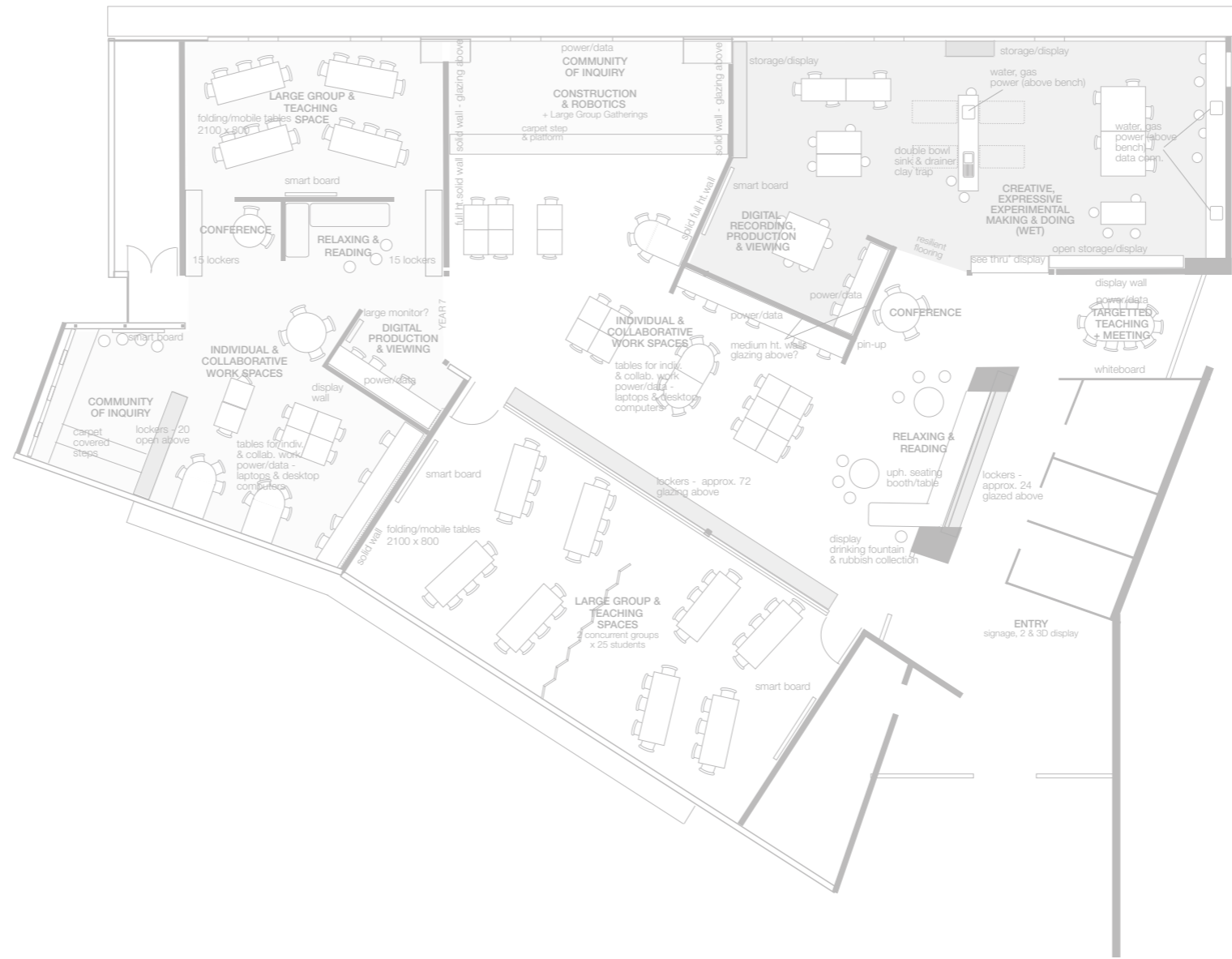
Figure 5.2: Site Master Plan, first floor

Teachers will work with students, operating as teams within this space.