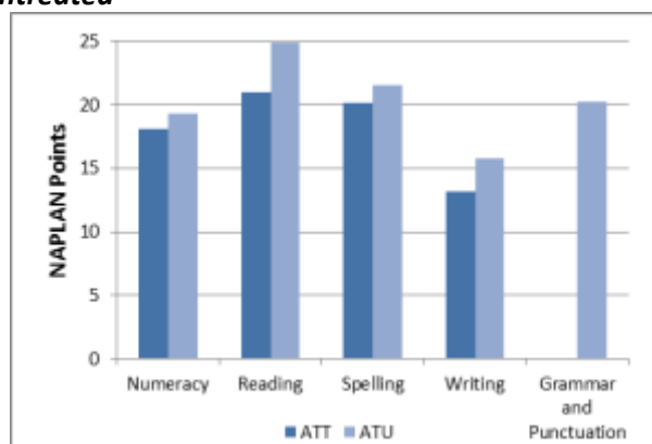
Figure 3: Average Treatment Effects on Treated and Untreated

These causal ATT estimates are substantial, given that one year of schooling at the Year 3 level is represented by 52 NAPLAN points, with pre-school amounting to 30–40% of the learning impact of one additional year of schooling, 3 years after the fact.