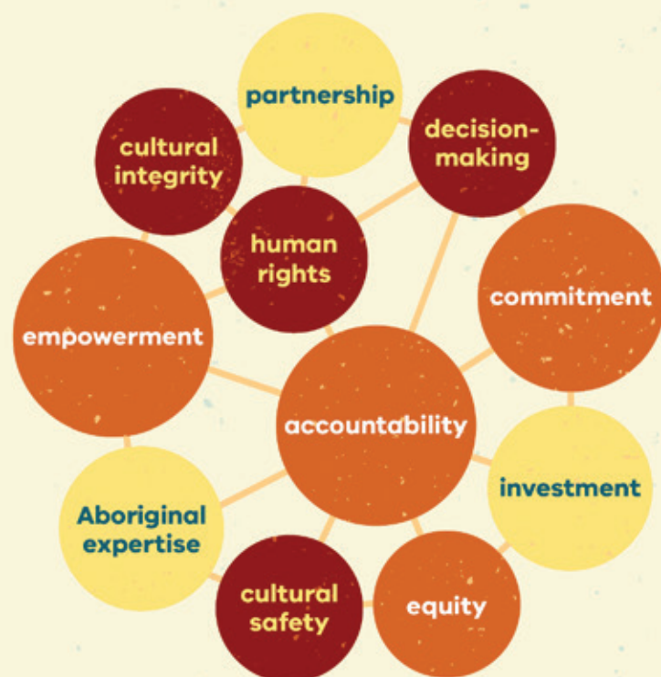
Figure 2 . Self-determination guiding principles:

Self-determination guiding principles, Victorian Aboriginal Affairs Framework 2018 – 2023, p. 24