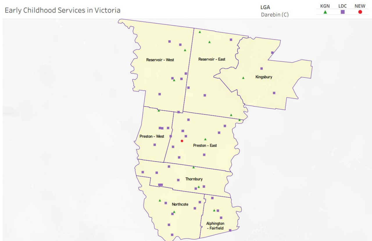
Early Childhood Services in Victoria

Note: In some instances, SA2s overlap multiple LGAs. Where this occurs, the SA2 and any services within it, are allocated to the LGA that it has the greater land area in. As a result, services that sit within these SA2s have been excluded from the above diagram as they are represented on the neighbouring LGA's map.