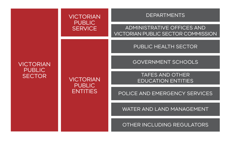
Figure 1: the composition of the Victorian public sector