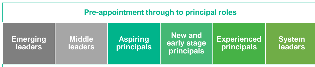
Figure 3: Career stage leadership development

Viewed through this lens, the evidence pointing to policy gaps is compelling: