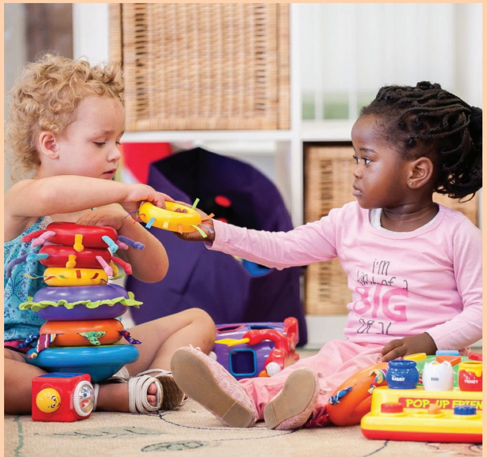
Pictured: Children from Doveton College Early Learning Centre

Approved providers with a service that has received an overall rating of 'Exceeding National Quality Standard' can apply for the Excellent rating. Further information is available at www.acecqa.gov.au/excellent-rating