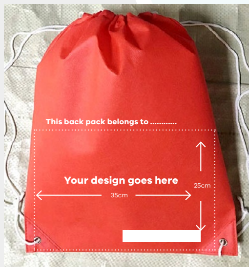
example of back pack artwork specifications